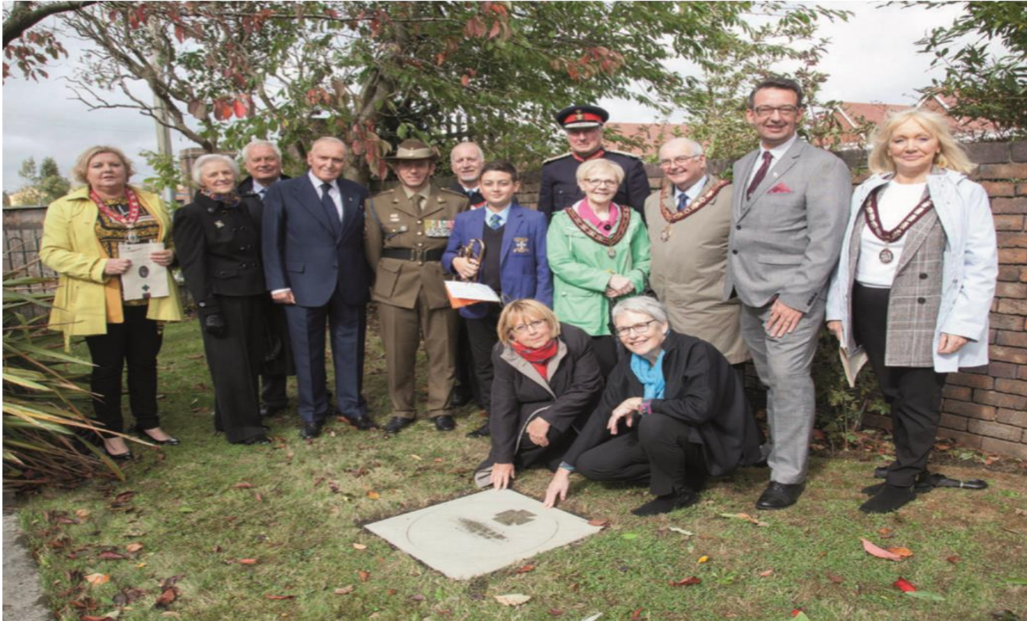
Armed Forces Covenant Flintshire County Council 7 May 2019